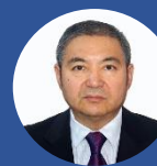
Yadikar Ghiniyov Information Minister