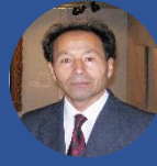
Neyimjan Karwan Justice Minister