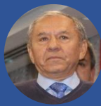
Syit Taranchi Interior Affairs Minister